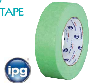
Priced per Roll