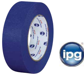
Priced per Roll