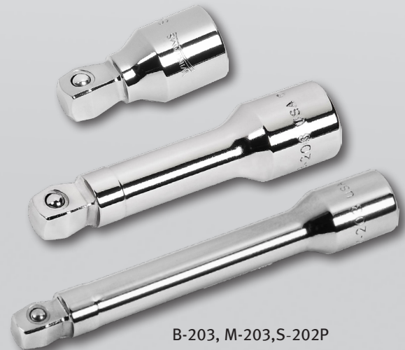
B-203, M-203, S-202P