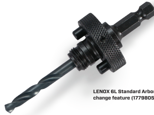
LENOX 6L Standard Arbor with quick change feature (1779805)

Split point pilot drill for faster penetration and less walking